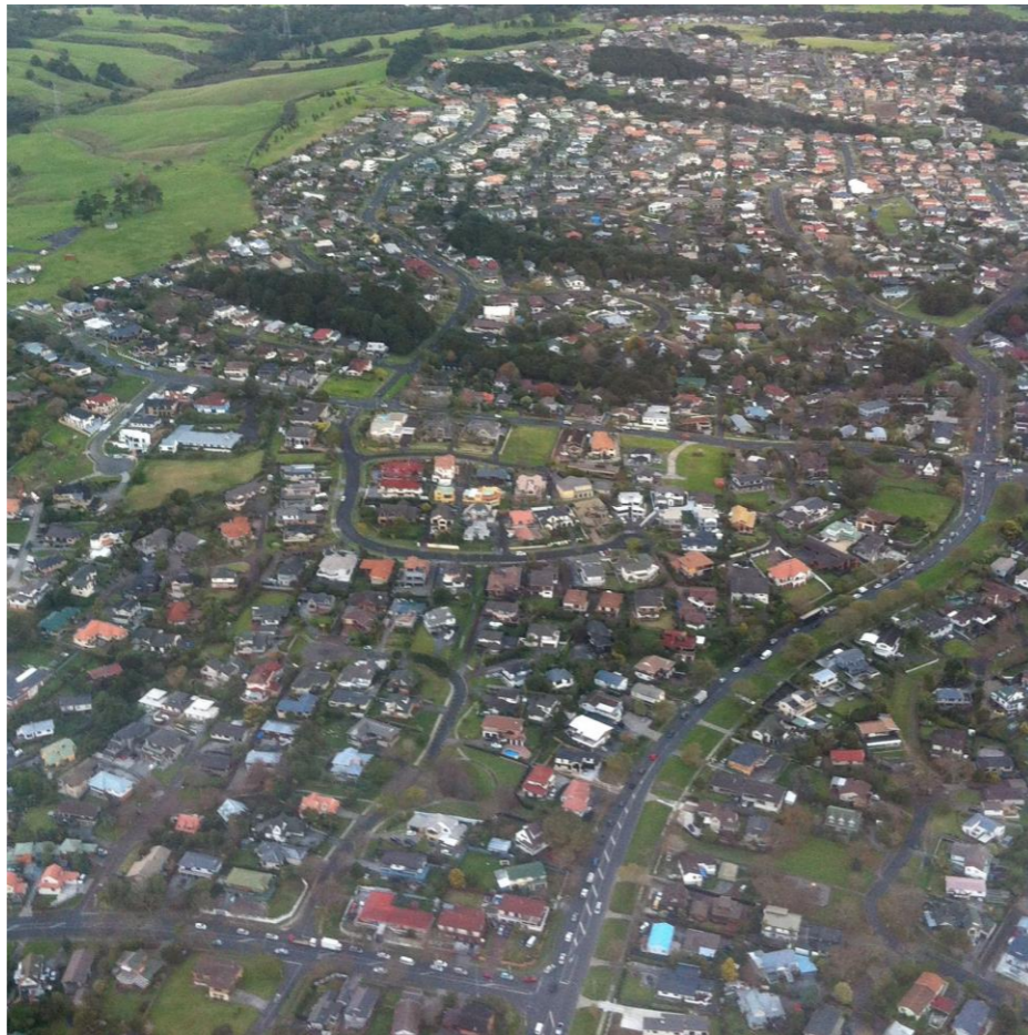
NZ - Auckland