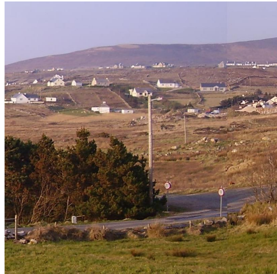
IRL - Donegal