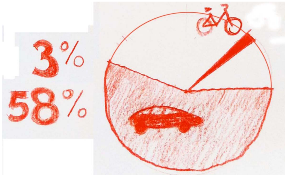
NZ - Wellington