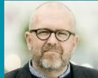
Lake Sagaris Chile