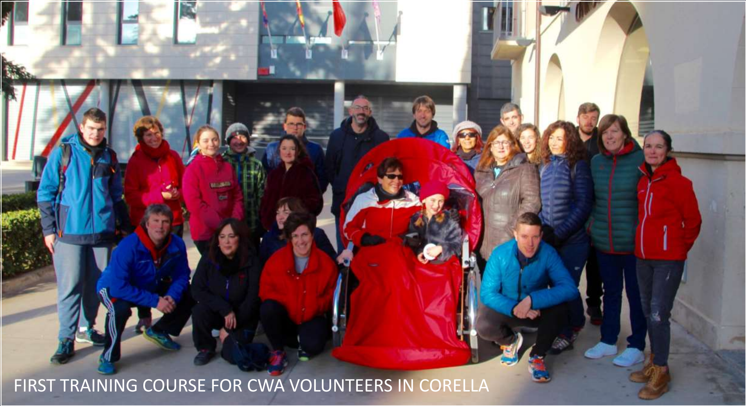
FIRST TRAINING COURSE FOR CWA VOLUNTEERS IN CORELLA